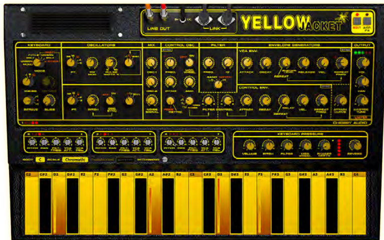
Yellowjacket not only visually resembles the original – including the striking yellow-black control surface – but also captures the rough character of the EDP Wasp with sensitivity.